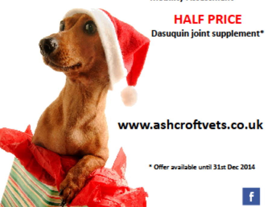
FREE Mobility Assessment*

Did you know 1 in 5 dogs suffer from joint pain? We want to help you and your pet stay active this Winter