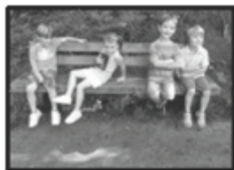
FAMILY WALK IN DELAMERE FOREST

The following day, the children visited the Tudor museum where they found out about Tudor punishments, sketched some of the local buildings and attended a performance of The Taming of the Shrew by the Royal Shakespeare Company. This was a fabulous visit and many of us didn't want to come home!