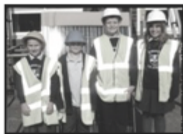
SOLAR PANELS FITTED ON SCHOOL ROOF