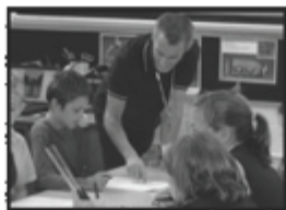
VISITING AUTHOR IN YEARS 3-6