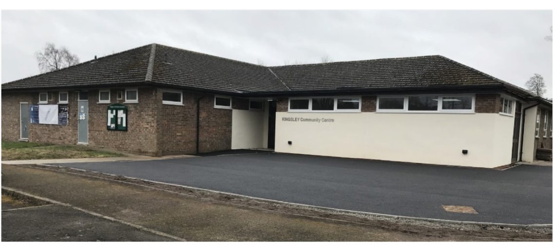
The news and voice of your village Community