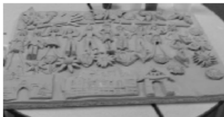
It is coming to life....almost finished!!