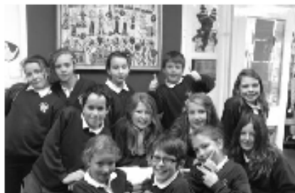
Year 6 with their ceramic creation