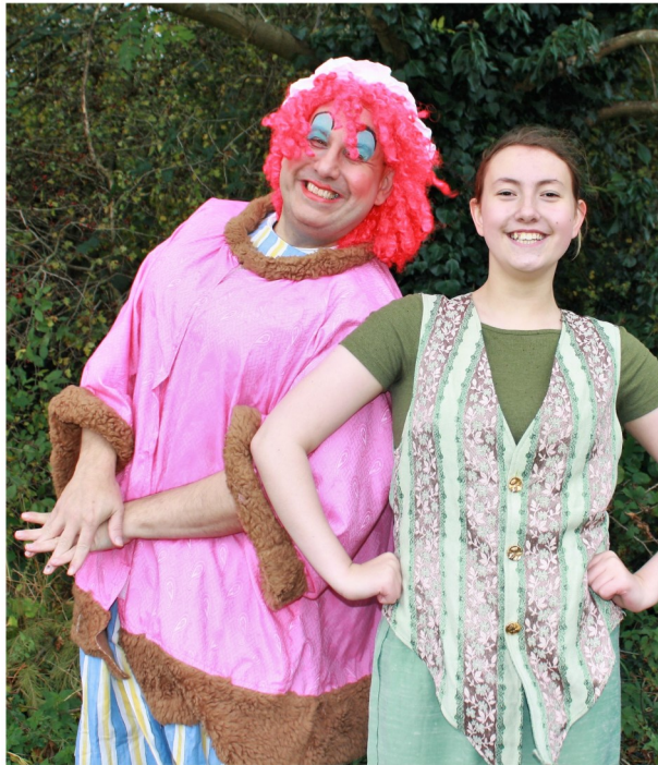
Peter Pan Panto - Kingsley Players, January 26th-29th

Kingsley Community Association is a registered charity