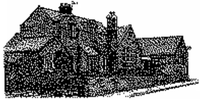
KINGSLEY ST. JOHN'S C.E. (AIDED) PRIMARY SCHOOL